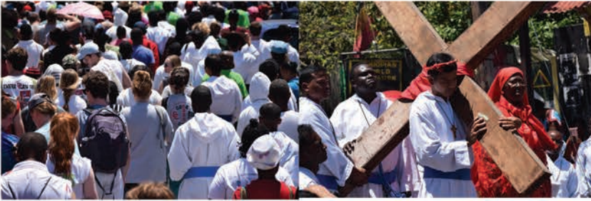
MARCH 30, 2018: STATION OF THE CROSS from KTHS to St. Ephraem's Chapel, Bethlehem Home.