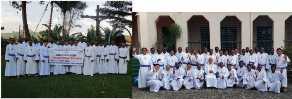
MAY 22, 2018: Prayer and Convoca- tion of the Finally Professed Brothers in Jamaica, Africa.