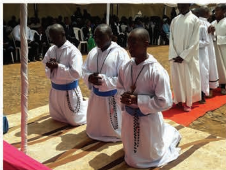
JUNE 23, 2018: 3 Brothers took their Final Profession of Vows in Kenya Mis- sion, AFRICA.