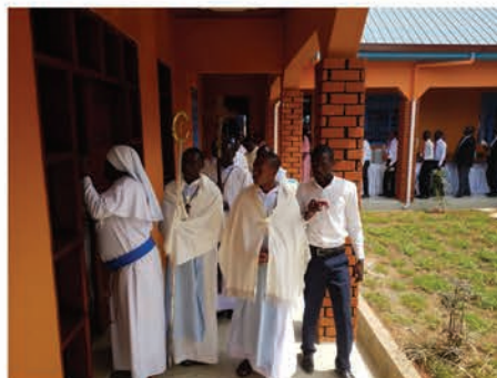
August 18, 2018. MOP Sisters Opening Ceremony of their Convent in Kampala.