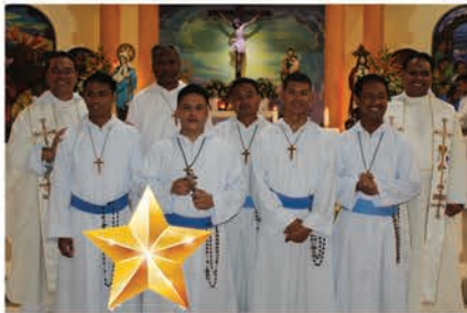
JUNE 28, 2018: 5 Brothers took their Final Profession of Vows in Naga Mission, Philip- pines.