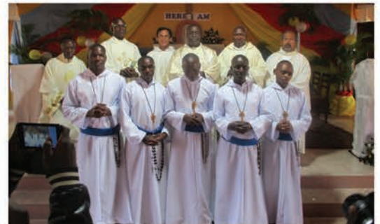
JULY 8, 2018: 5 Novice Brothers took their First Profession of Vows in Uganda Mission, Africa.