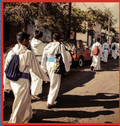
Our Cover: Jamaica Mission Brothers in the streets of the ghetto of Kingston Jamaica.