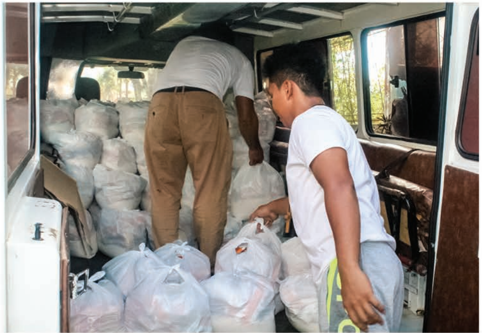
Brothers loading food packages to be distributed to typhoon victims.

The people of this Island nation have not known a year without devastation. Every year comes with a cost, and this year is one of the worst. As we celebrate this most joyous time of the year, let us remember our suffering brothers and sisters in the Philippines, who only have tears in their eyes at this moment and in this joyous Christmas season, please help us put a smile on their faces.