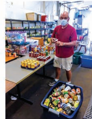
M.O.P. associate sorting out food items.

Besides, friends and associates of the Missionaries of the Poor extend their hands in helping the Brothers packing food items. Some have donated a pallet of rice and cornflour. And two parishes St. Thomas and St. Mathew, also collected some food items to distribute to the people.