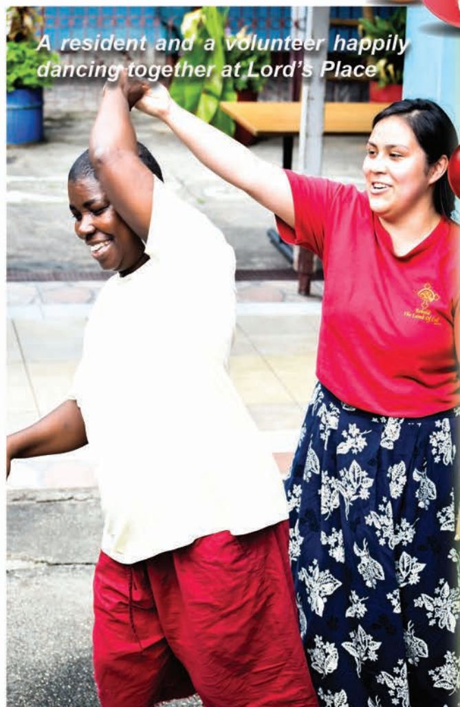
A resident and a volunteer happily dancing together at Lord's Place

But the angel said to them, "Do not be afraid; for behold, I bring you good news of great joy