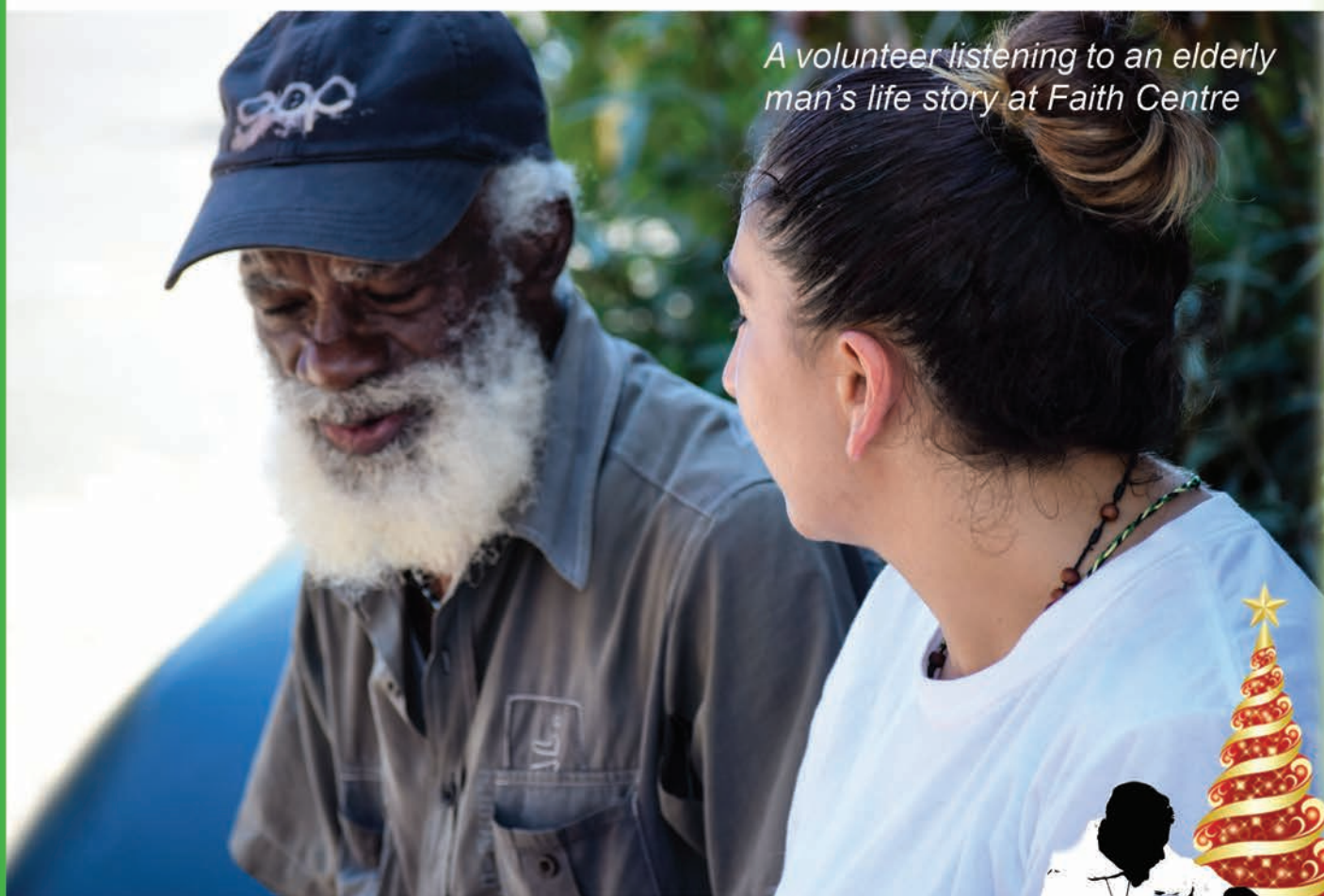
A volunteer listening to an elderly man's life story at Faith Centre