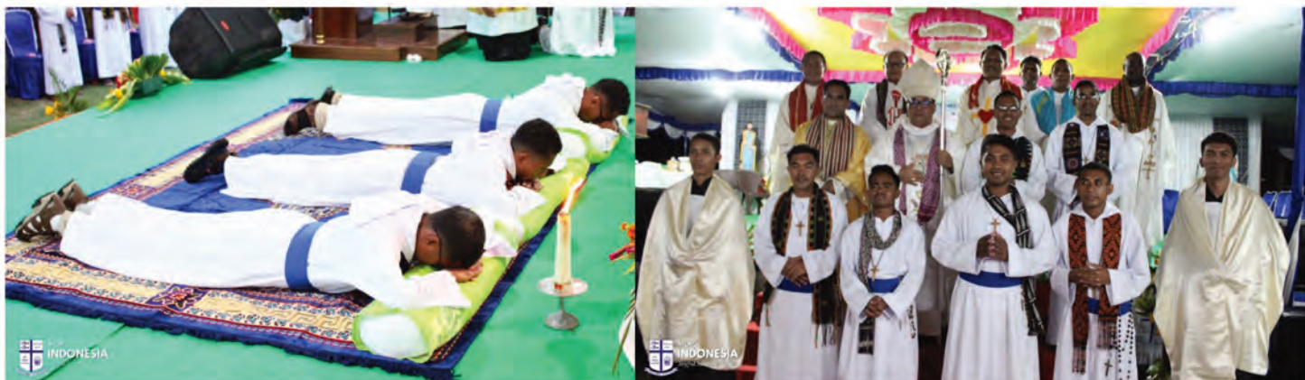
On September 14, 2024, in Flores, Indonesia, three MOP Brothers made their final vows and three MOP Brothers made their first vows