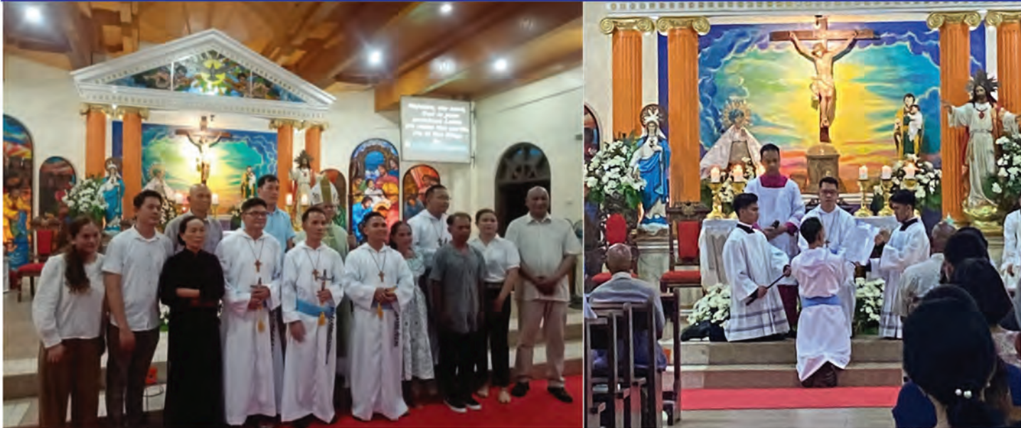
On September 8, 2024, four MOP Brothers took their final profession of vows in Naga, Philippines