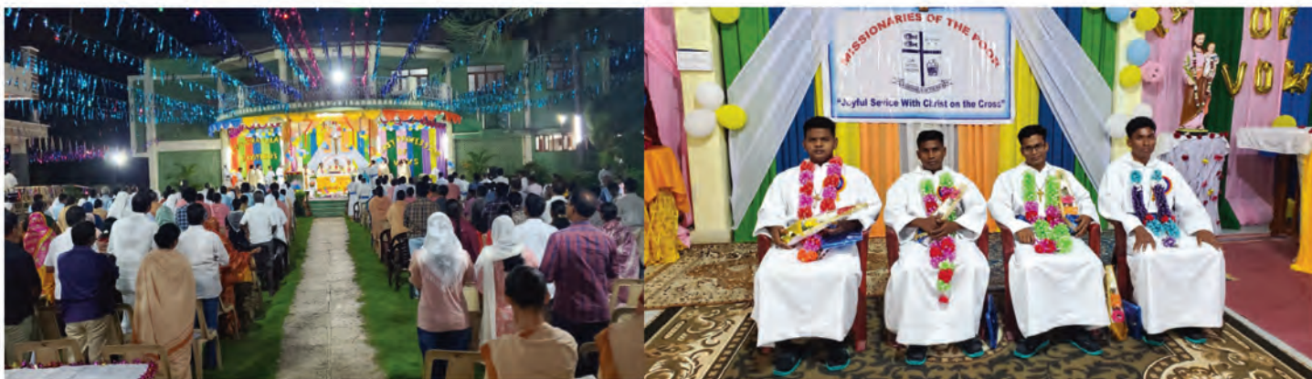
On October 28, 2024, four MOP Brothers took their first profession of vows in Warangal, India