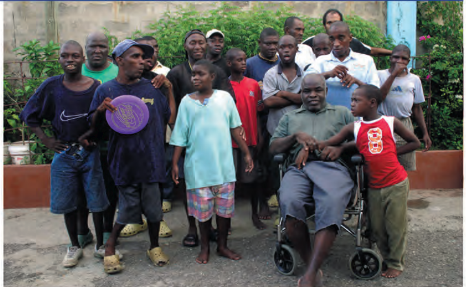
Early residents of Faith Center Home